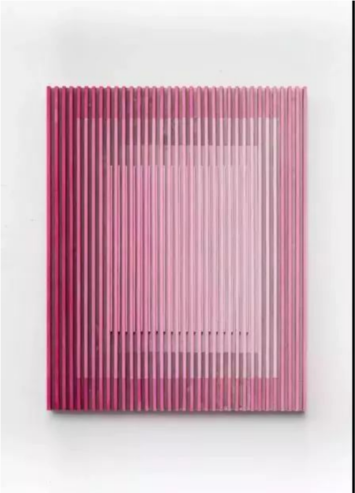
Room 519 Infinity Space